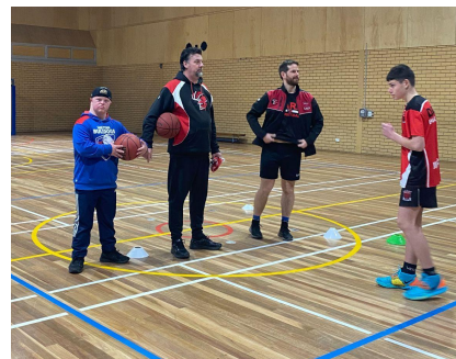
Assistant Basketball coach